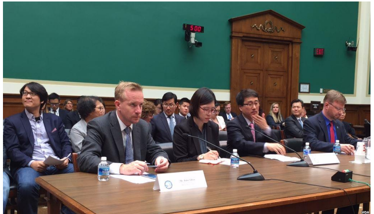
On Capitol Hill with Ambassador Jong Hoon Lee and the visiting delegation just before the Congressional Hearing; Photo of Congressional hearing panel courtesy of Voice of America

http://www.voakorea.com/content/article/2742816.html