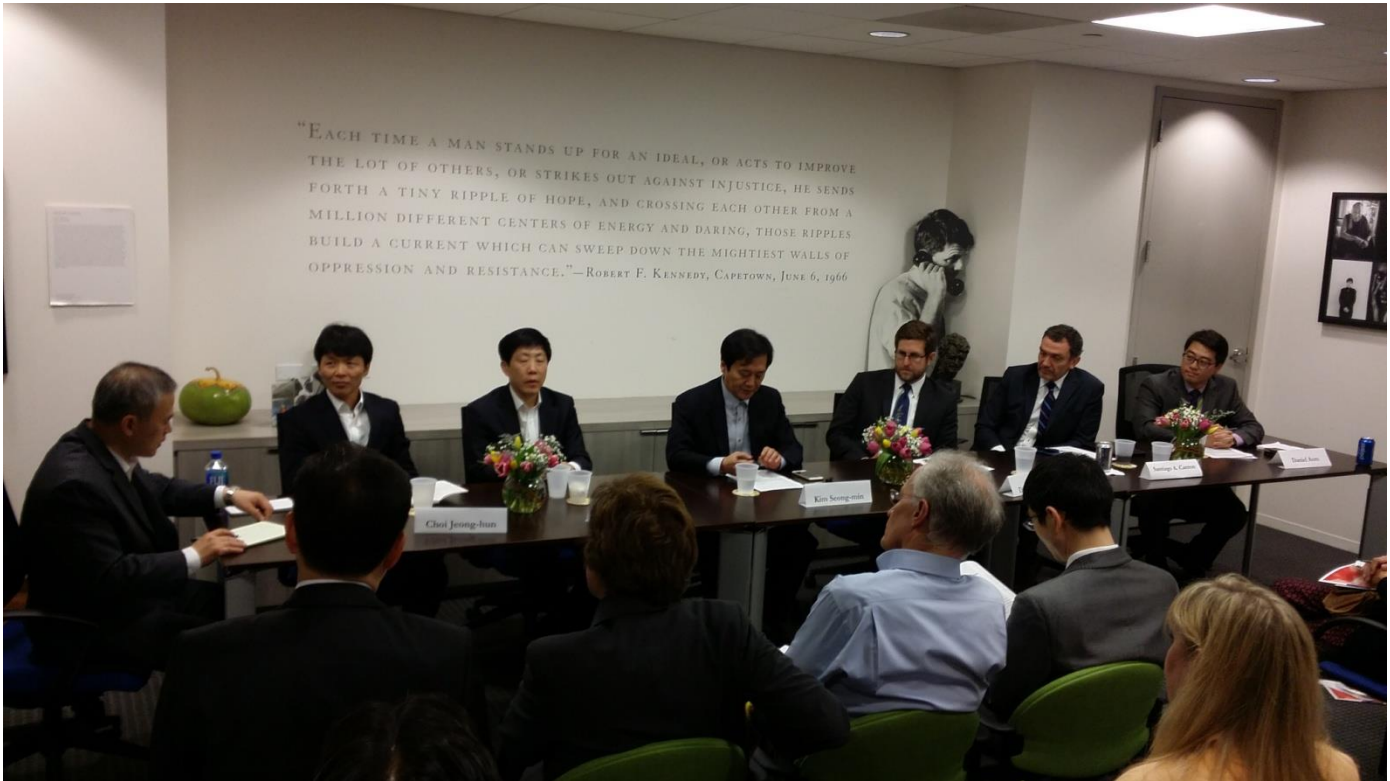
RFK Center's Panel on Information