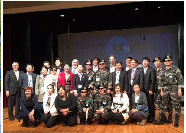
Wreath Laying Ceremony at the Korean War Memorial; NKinUSA Concert at The Landon School http://www.christiantoday.co.kr/view.htm?id=282824