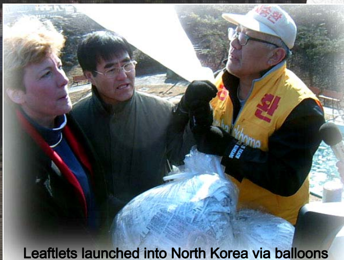
Leaflets launched into North Korea via balloons