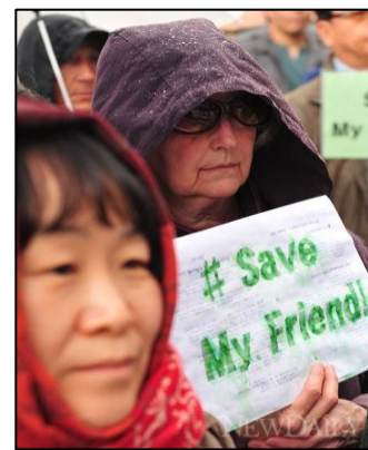
Activists in Seoul held a demonstration in front of the Chinese Embassy.